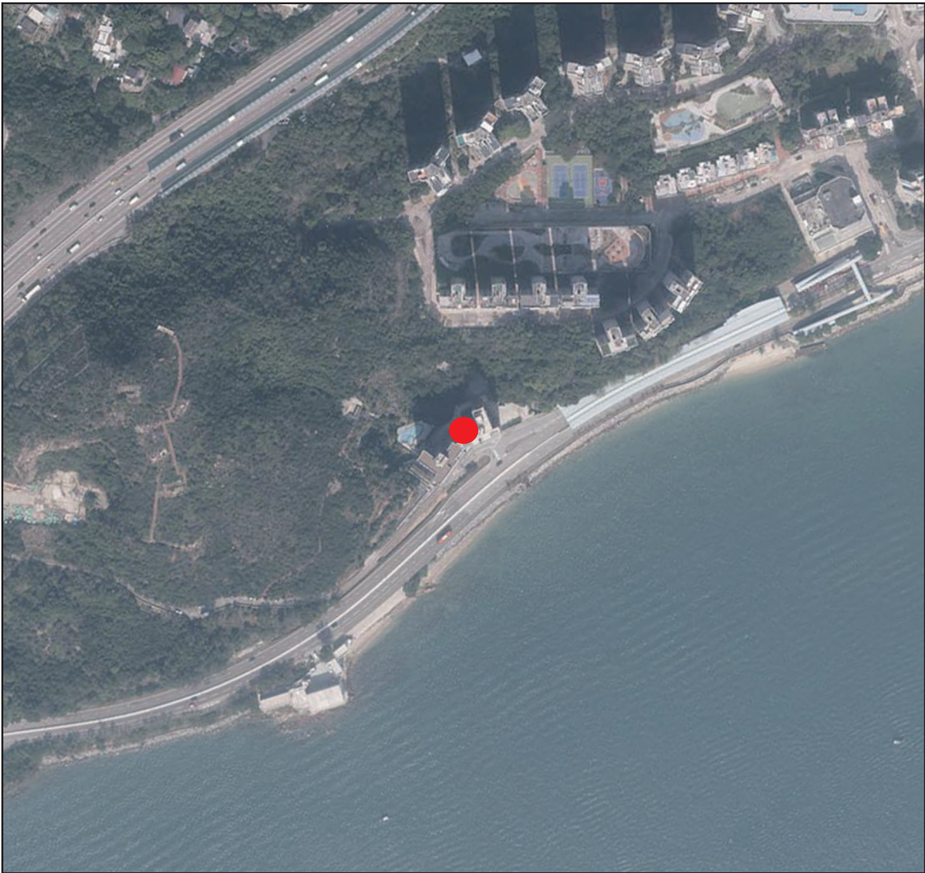
● Location of the Development 發展項目的位置

Adopted from part of the aerial photograph taken by the Survey and Mapping Office of the Lands Department at a flying height of 6,900 feet, Photo No. E213184C dated 28 November 2023. 摘錄自地政總署測繪處在6,900呎的飛行高度拍攝之鳥瞰照片，照片編號E213184C，日期為2023年11月28日。